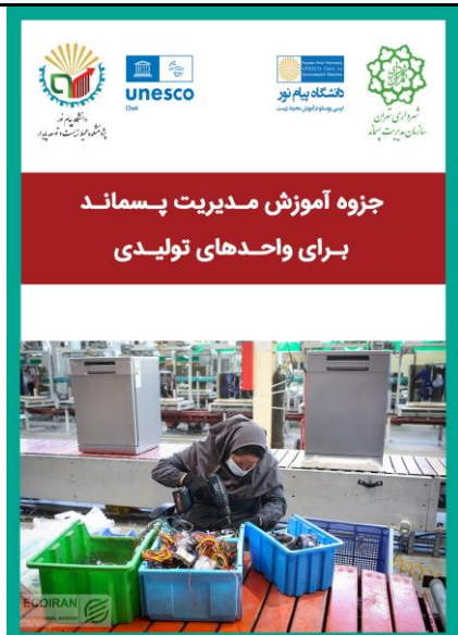
Waste Management Training for Production Units